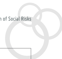
Table 1 Operationalisation of the selected social risks